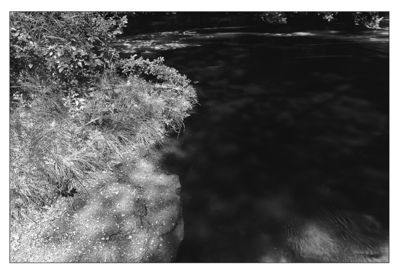
Bog ore ledge on the Mullica River