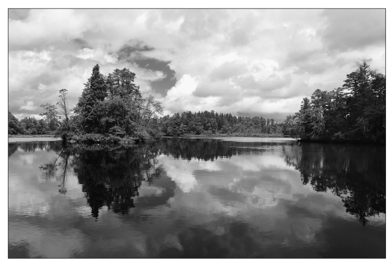
The Forks

few days, the spy was freed and told to "go and sin no more." It's not likely he ever again betrayed his colonial countrymen.