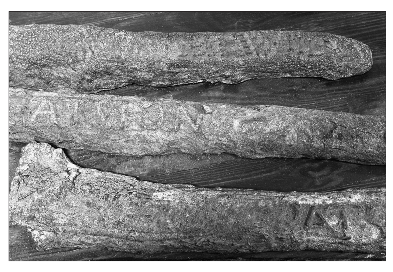
Pig iron

designed to favor British trade. Britain also had an interest in keeping the colonies dependent on the monarchy for manufactured goods which it could sell to them at inflated prices.