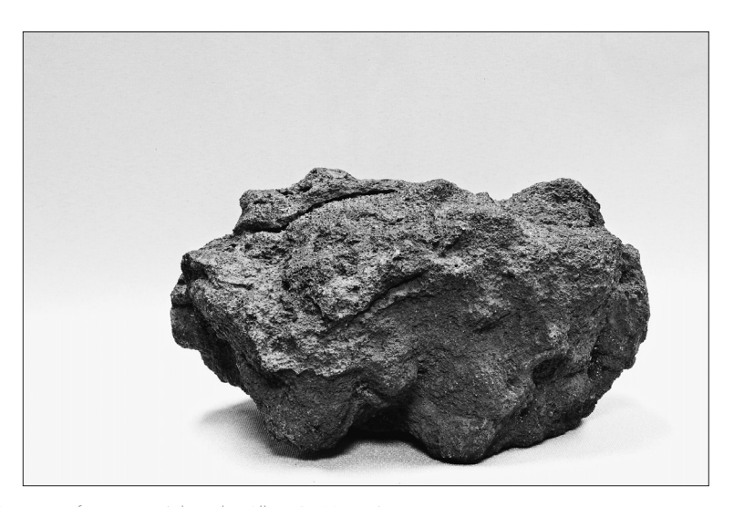
Bog ore after mining